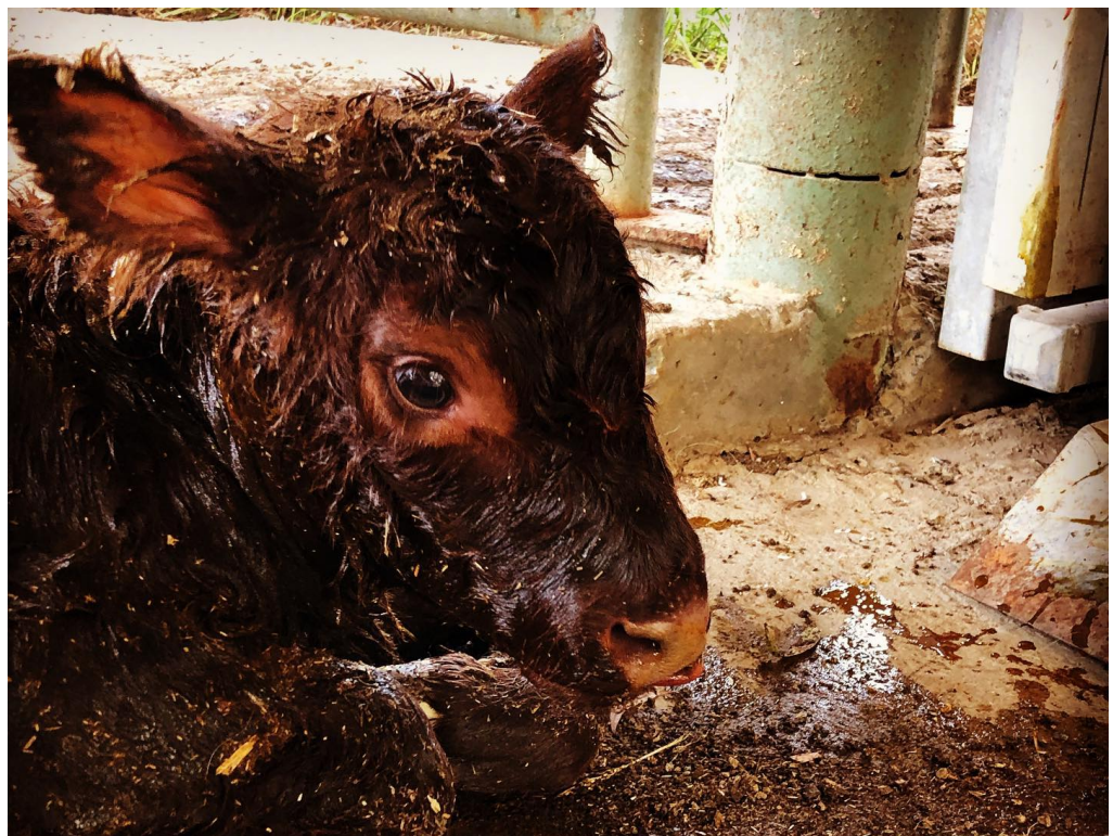
A little shorthorn calf taking his first breath's after a breech delivery.